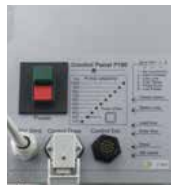
Detail of panel Fog 70 Var2

The industrial fog modules are specially designed for independent fogging of two or more areas. Choose the Var 2 and Var 3 modules: equipped with an inverter that allows the pump capacity to be adjusted depending on active lines. Thanks to the sensors, any changing fogging requirements are detected, depending on the measured humidity and temperature values.